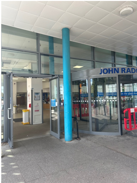
1. JR Main Entrance (next to M&S)

Our location is the FMRIB building which is located at the John Radcliffe Hospital . From the main entrance follow the signs to FMRIB or use the guide and map below