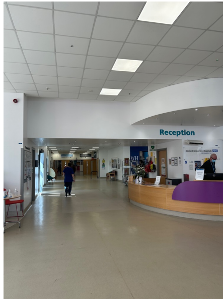
2. Walk along the main hospital corridor, past the league of friends café, following the signs to ' lift area B MRI/OCMR/FMRIB '